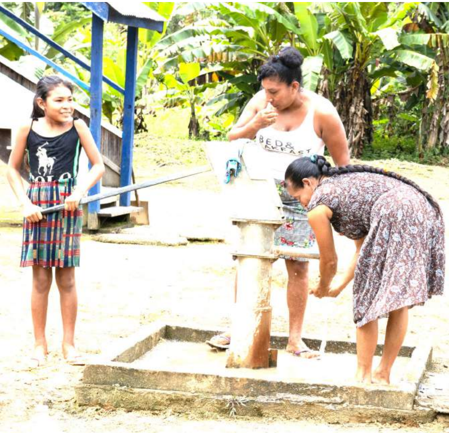
Amerindian residents accessing water from a standpipe in the community