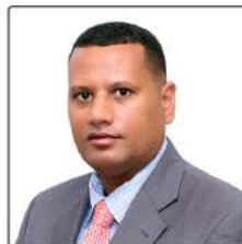
HON. COLLIN CROAL MINISTER OF HOUSING & WATER