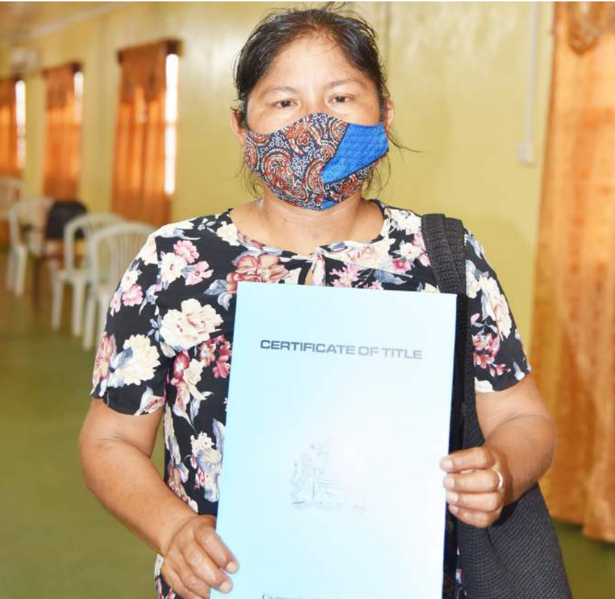
A resident of Region Nine with her Certificate of Title for her land