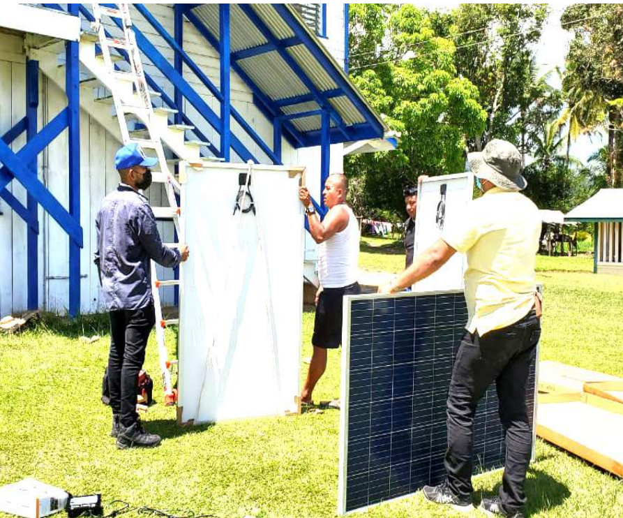
Information Communication Technology equipment being installed in Paruima, Region Seven.