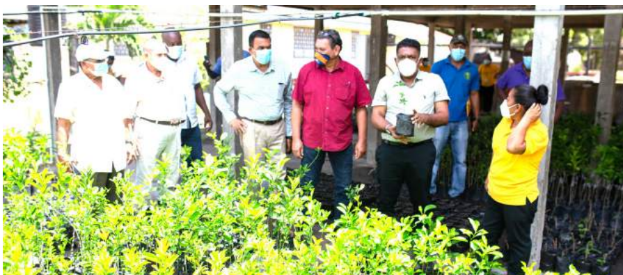
Minister of Agriculture, Hon. Zulfikar Mustapha inside the shade house in Nappi, Region Nine.

Particular focus has been on building the emerging agriculture sector in Region Nine. Within the year, the Guyana Livestock Development Authority's (GLDA) extension office in the region increased its capabilities to offer improved services to livestock farmers in the Rupununi, through the acquisition of a hematology machine. A shade house was commissioned in Nappi; while $3 million was invested to commence the cultivation of corn and soya bean in Moco Moco Village, North Rupununi. Rupertee received 400 black giant birds, incubator, and a plant nursery to boost the village's economy. The Agriculture Ministry began working to resuscitate rice cultivation at the Santa Fe mega farm in Region Nine.