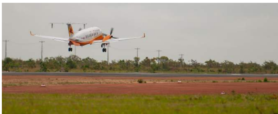
An aircraft taking off from the new runway at Lethem, Region Nine

The removal of the Value Added Tax (VAT) on travel has significantly reduced the cost of airfare for hinterland travel.