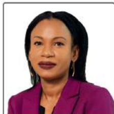
HON. ONEIDGE WALROND MINISTER OF TOURISM, INDUSTRY & COMMERCE