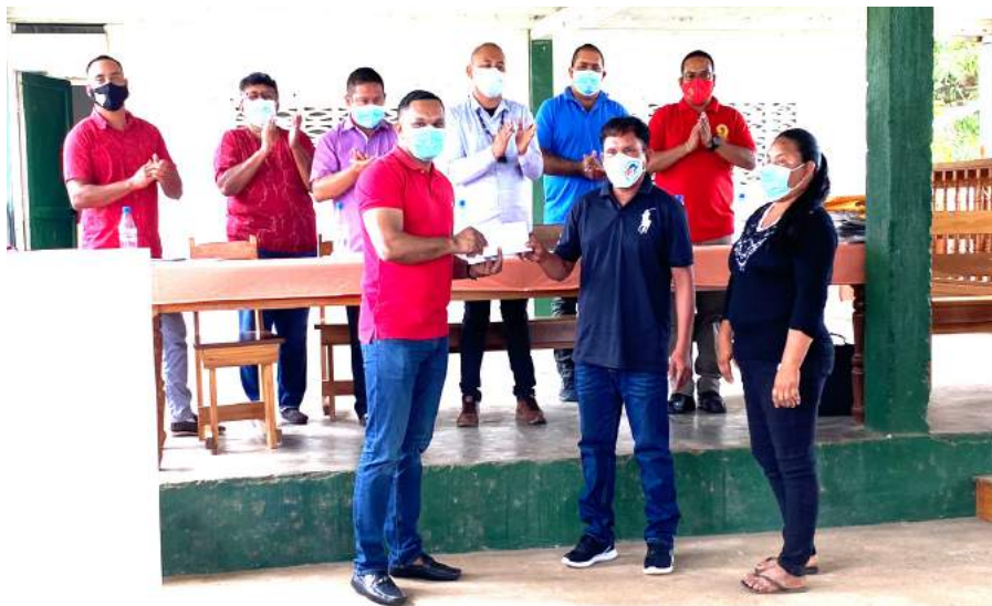
Minister of Natural Resources, Hon. Vickram Bharrat handing over COVID-19 cash grants to Amerindian village leaders.

On September 7, 2020, President Ali announced that provisions would be made for every household to benefit from a grant to help cushion the effects of the Covid -19 pandemic. Amerindians and Hinterland residents were the first to benefit from the roll-out of this $25,000 per household cash grant.