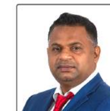
HON. DEODAT INDAR MINISTER WITHIN THE MINISTRY OF PUBLIC WORKS