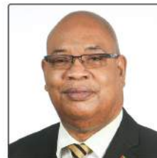
HON. JUAN EDGHILL MINISTER OF PUBLIC WORKS