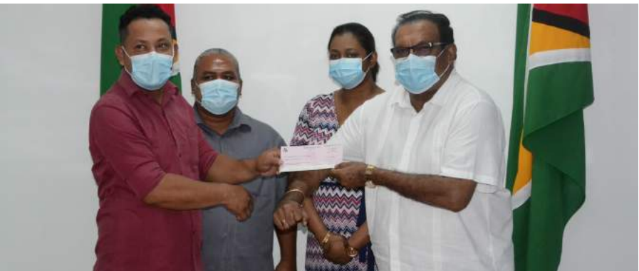
Mayor of Mabaruma, His Worship Chris Phang receiving a subvention cheque valued $9 million from Minister within the Ministry of Local Government and Regional Development, Hon. Anand Persaud.