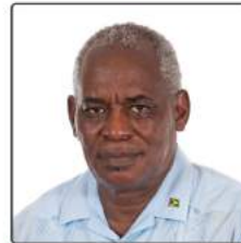
HON. ROBESON BENN MINISTER OF HOME AFFAIRS