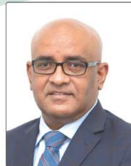
HON. DR. BHARRAT JAGDEO VICE PRESIDENT