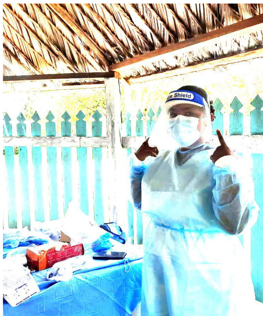
Guyana Tourism Authority's Hygiene and Sanitation Training in Lake Capoey

Lethem and Mabaruma. The Bureau of Standards also expanded its capacity to conduct National Quality Award audits nationwide through the Opening of a Region Seven branch office