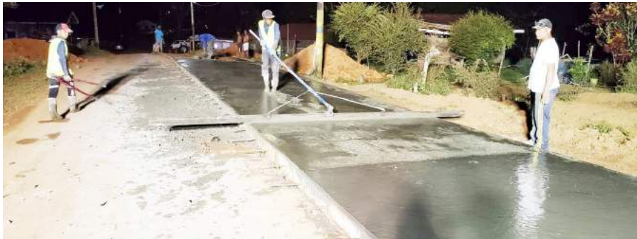
Rehabilitation works ongoing on Compound Road in Mabaruma

-Plans to continue 1km of Rigid Pavement from Kumaka to Kwebanna