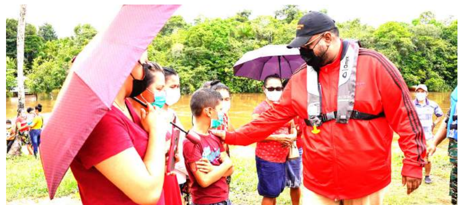
H.E Dr. Irfaan Ali meeting with flood-affected residents in Region Two

President Ali recently assured Amerindian and Hinterland residents that more long-term flood interventions will be rolled out to assist them in rebuilding, stronger and better.