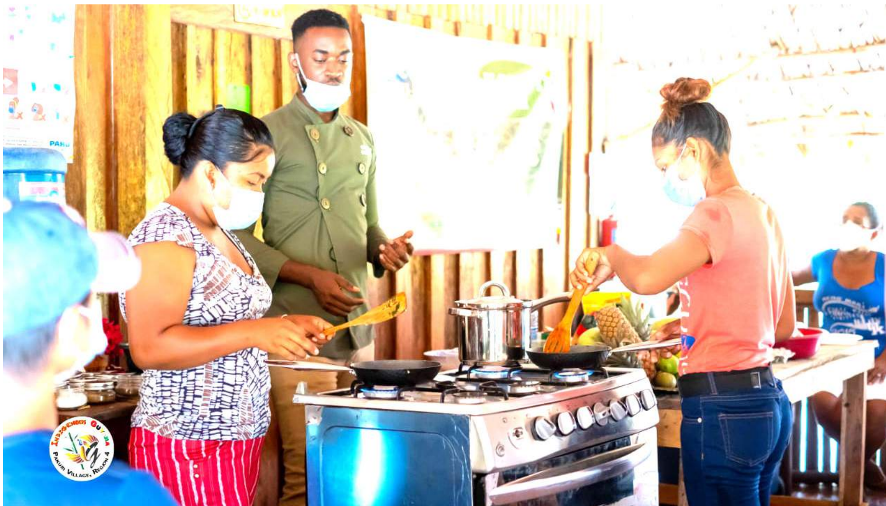
Guyana Tourism Authority conducting Culinary Arts training in St Cuthbert's Mission

Efforts were also undertaken to boost Amerindian and Hinterland tourism products