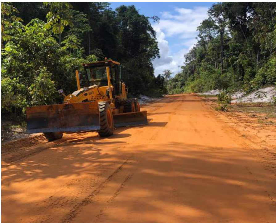
Works ongoing on the Bartica Potaro Road

-Upgrade of 1km of unsurfaced road to asphalt in Bartica