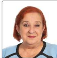
HON. GAIL TEIXEIRA MINISTER OF PARLIAMENTARY AFFAIRS & GOVERNANCE