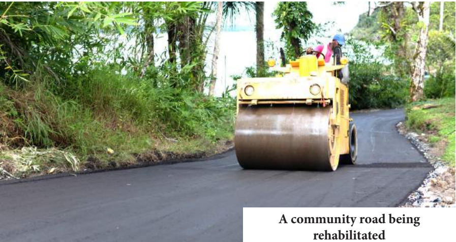
A community road being rehabilitated