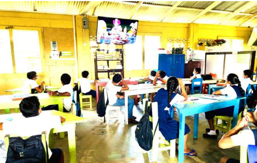
Students of the Aishalton Primary School, Region Nine looking at the Guyana Learning Channel that is now accessible in their school.