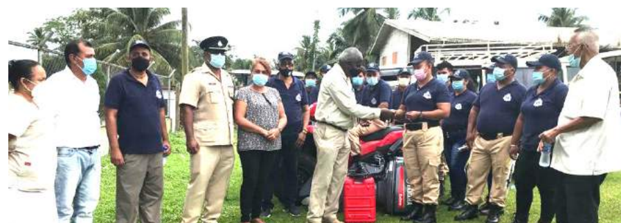
Minister of Home Affairs, Hon. Robeson Benn handing over an All-Terrain Vehicle and a 40-horsepower engine to the newly formed Moruca Community Policing Group.