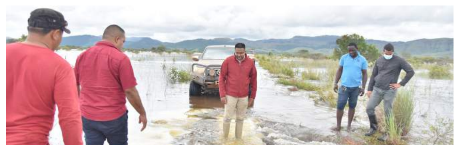
Minister of Local Government and Regional Development, Hon. Nigel Dharamlall visits flood-affected areas in Region Nine