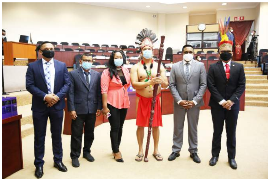
Deputy Speaker, Lenox Shuman (centre) with Government Ministers and Members of Parliament at the opening of the 12th Parliament at the Arthur Chung Conference Centre.

The launch of Amerindian Heritage Month 2020 coincided with the opening of the twelfth Parliament. Not only were five talented Amerindians sworn in as Members of Parliament (MPs) for the PPP/C, but the government also supported the appointment, for the first time, of a Deputy Speaker of Amerindian heritage. Leader of the Liberty and Justice Party and representative of the joinder list in the National Assembly, Hon. Lenox Shuman was elected to the post following a nomination by the Minister of Governance and Parliamentary Affairs. The government MPs, with their 33 majority in the House, voted in favour of the submission.