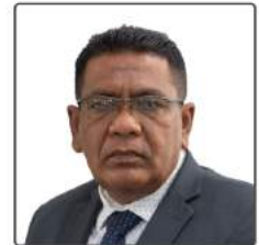
HON. ZULFIKAR MUSTAPHA MINISTER OF AGRICULTURE