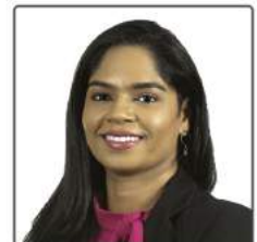
HON. SONYA PARAG MINISTER OF PUBLIC SERVICE