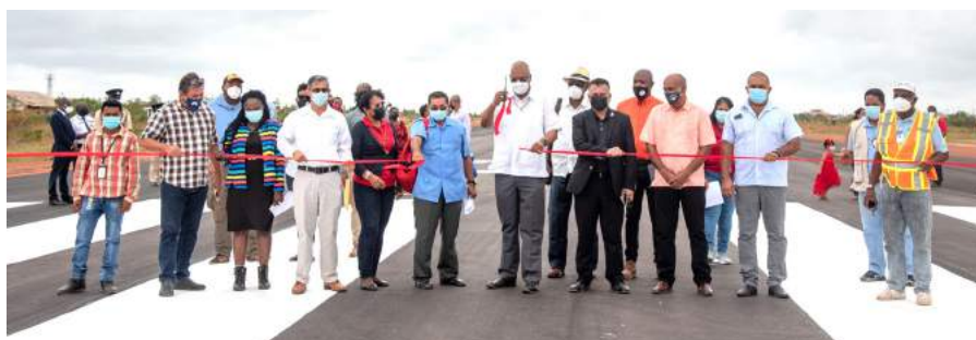
The Ministry of Public Works commissioned the $185 million new and extended runway which will allow larger aircraft to land at the Lethem Airport in Region Nine.

The feasibility study and design for the upgrade of the Lethem Aerodrome to a Regional Hub is expected to be completed by the third quarter of 2021. In March this year, the government commissioned the extension of the runway, a project that costs $185 million.