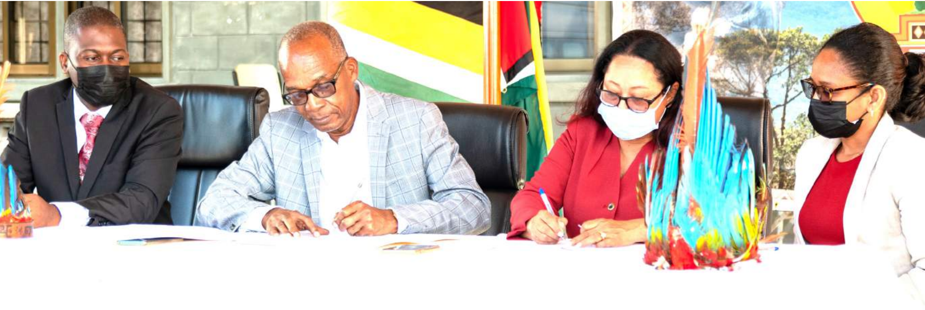
Minister of Labour, Hon. Joseph Hamilton and Minister of Amerindian Affairs, Hon. Pauline Sukhai signing a Memorandum of Understanding which will see 440 Community Support Officers from hinterland communities receiving skills training.

As promised, the government has rolled out several economic stimulus programmes to Hinterland communities, supported by two comprehensive budgets and supplementary paper in one year.