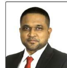
HON. NIGEL DHARAMLALL MINISTER OF LOCAL GOVERNMENT & REGIONAL DEVELOPMENT