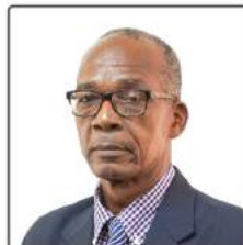
HON. JOSEPH HAMILTON MINISTER OF LABOUR