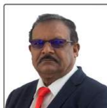
HON. ANAND PERSAUD MINISTER WITHIN THE MINISTRY OF LOCAL GOVERNMENT & REGIONAL DEVELOPMENT