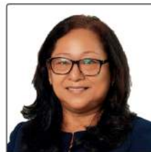
HON. PAULINE SUKHAI MINISTER OF AMERINDIAN AFFAIRS