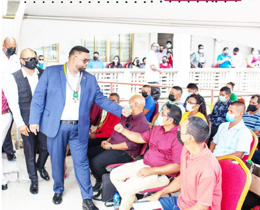
H.E Dr. Irfaan Ali greeting Amerindian Toshao's at a recent function.

The People's Progressive Party Civic (PPP/C) has a long track record – 23 years – of providing support and working with Indigenous Guyanese to ensure they have access to education, health care, and that they benefit from a diversified village economy with opportunities for job creation, and a brighter future for themselves and Guyana.