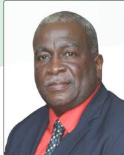
MARK PHILLIPS PRIME MINISTER HON. BRIG (R'TD)