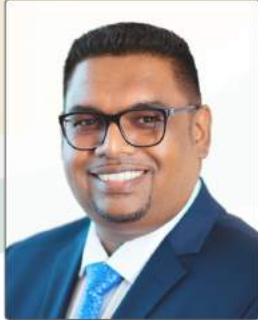
DR. IRFAAN ALI HIS EXCELLENCY PRESIDENT