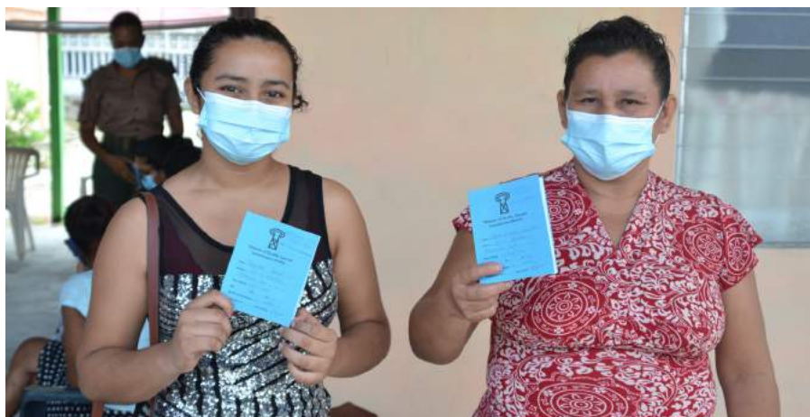
These two Amerindian women proudly display their vaccination cards

Amerindians and Hinterland residents are being vaccinated under the National COVID-19 Prevention and Control Programme that includes pursuing the agenda of ensuring at least 500,000 people are vaccinated against the virus this year. PCR testing using Gene Expert equipment is being done at all regional hospitals.