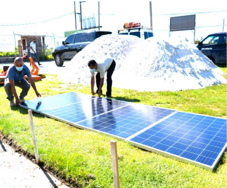
Hinterland residents were trained in the setting up of photovoltaic systems under the Office of the Prime Minister’s Information Technology (ICT) Access and eService for Hinterland Poor and Remote Communities Project.

-The solar panel and the one laptop programmes