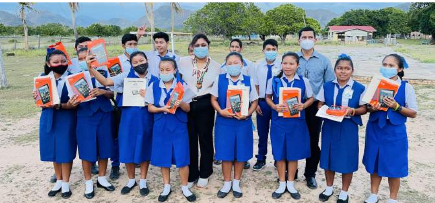
Minister of Education, Hon. Priya Manickchand standing with students of the Karasabai Primary Top in Region Nine who received pre-loaded tablets

Amerindian and Hinterland students were continuously supplied with learning resource material including pre-loaded tablets to continue learning during the pandemic. The Guyana Learning Channel’s (GLC) reach was extended into hinterland communities, and schools were equipped with supporting equipment including televisions, allowing students access to the televised content.