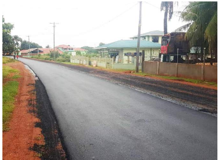
Rehabilitation of internal Roads in Lethem

-1km of DBST Road in St. Ignatius will be upgraded to asphalt