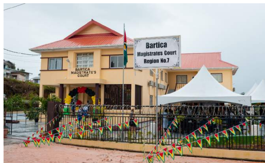
The Bartica Magistrate's Court