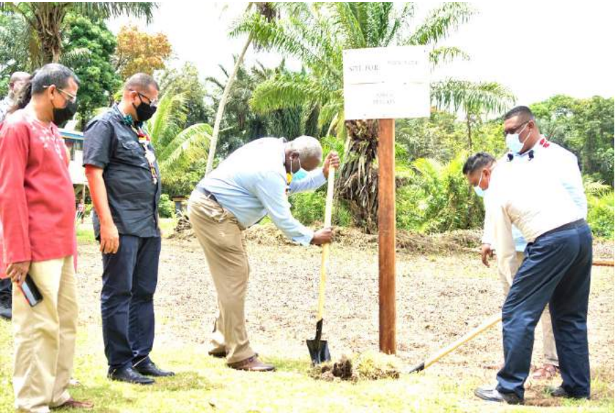
Prime Minister, Hon. Brigadier (ret'd) Mark Phillips (centre) turning the sod for the power generation facility in Whitewater, Region One