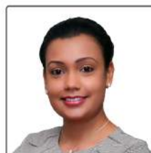
HON. SUSAN RODRIGUES MINISTER WITHIN THE MINISTRY OF HOUSING & WATER