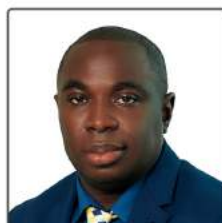
HON. KWAME M C COY MINISTER WITHIN THE OFFICE OF THE PRIME MINISTER