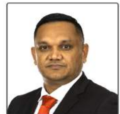
HON. VICKRAM BHARRAT MINISTER OF NATURAL RESOURCES