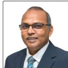
HON. DR. FRANK ANTHONY MINISTER OF HEALTH