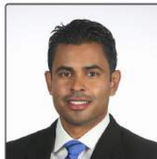
HON. CHARLES RAMSON MINISTER OF CULTURE YOUTH & SPORT