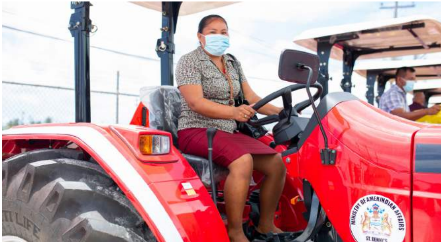
A Toshao in one of the new tractors

As part of the government's commitment to stimulate agricultural production to ensure food security across the hinterland is sustained and secured, 112 tractors were procured. Already, many of them have been handed over to communities.