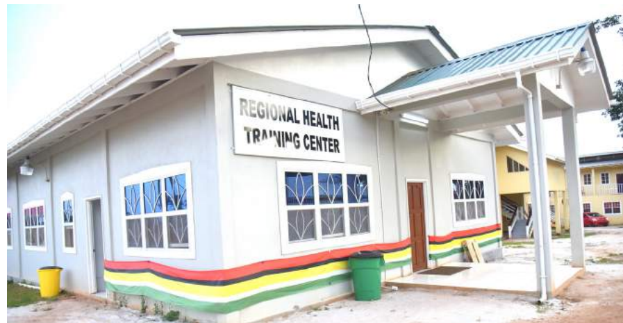
The Regional Health Training Centre in Region One.

Prime Minister, Hon. Brigadier (ret'd) Mark Phillips recently commissioned a new building, which will house the Regional Health Training Centre in Region One. This is the first time that the region will have such a facility.