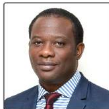
HON. HUGH TODD MINISTER OF FOREIGN AFFAIRS