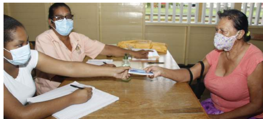
A Pensioner in the Hinterland receiving her payment