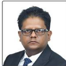
HON. DR. ASHNI SINGH SENIOR MINISTER, OFFICE OF THE PRESIDENT WITH RESPONSIBILITY FOR FINANCE