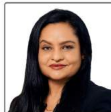
HON. DR. VINDHYA PERSAUD MINISTER OF HUMAN SERVICES & SOCIAL SECURITY