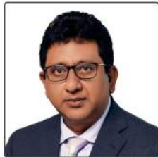
HON. ANIL NANDLALL ATTORNEY GENERAL & MINISTER OF LEGAL AFFAIRS