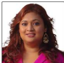
HON. PRIYA MANICKCHAND MINISTER OF EDUCATION